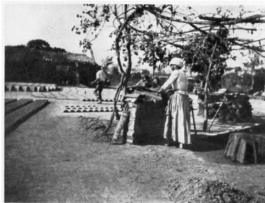
A factory of red roof-tiles near Naples. The girl works from daylight to dark for sixteen cents