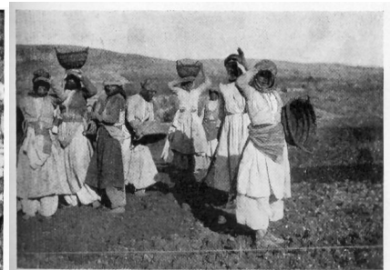
On the road between Haifa and Nazareth I meet a road-repair gang, all women but the boss